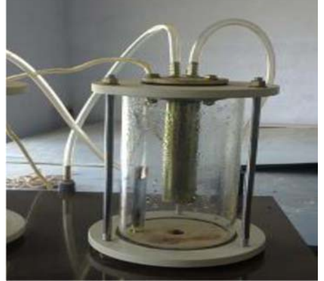
Fig.1 Dropwise Condensation

Dropwise condensation occur when saturated pure vapour comes in contact with the cold surface such has copper tube. When considering surface is contaminated with substance which prevents condensate from the wetting surface the vapour will condense in drops instead of a continuous film. Though dropwise condensation would be preferred to filmwise condensation yet it is extremely difficult to achieve or maintain it for long time because most surfaces becomes wetted after being exposed to condensing vapour over a period of time .Dropwise condensation can be obtained under control conditions with the help of certain additives to the condensate and various surfaces coatings but it is commercial viability has not yet been approved for this reason the condensing equipment in use is designed on the basis of filmwise &dropwise condensation.[4]The vapour starts condensing on a surface when the vapour saturation temperature is more than the surface temperature, the temperature of the condensate