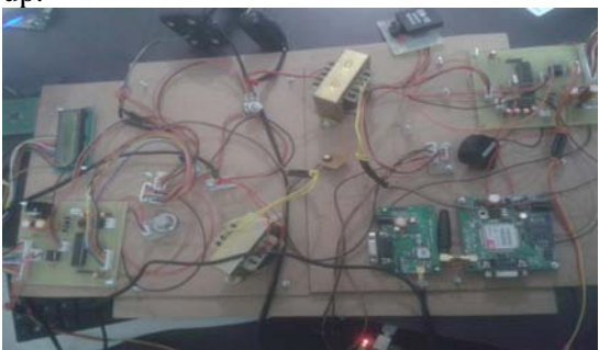
Fig.2. Hardware set up as per the block diagram Above figure shows how exactly CAN communication takes place. Left part of the figure shows master which communicate with the right part as slave. Security system is implemented on slave over here.

Following Fig.2. shows practical hardware set up.