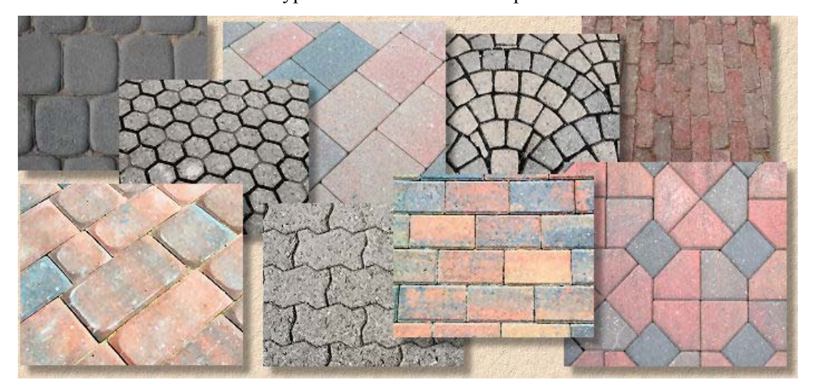
Concrete Paver Blocks Laying patterns