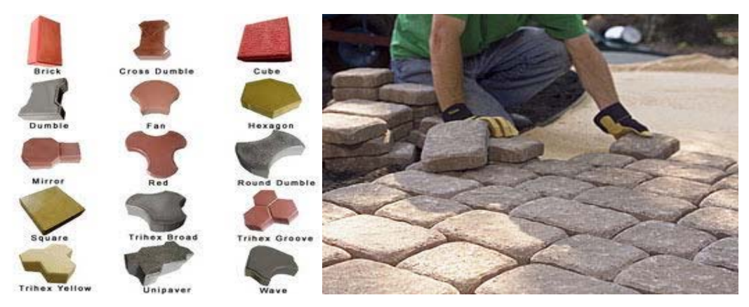
Different types & shades of concrete paver blocks