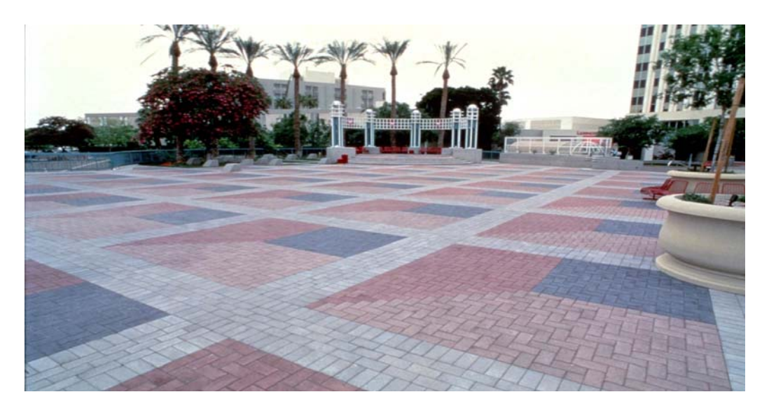
Typical Arrangement used for Drive Way