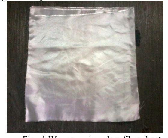
Fig. 1. Woven roving glass fiber sheet Many a time a mould is also used in hand layup method. It is generally used whenever the composite is not directly joined with the structure. Moulds come in various shape, sizes starting from a flat sheet to having infinite curves and corners. Before fabrication the mould is first prepared with the application of releasing agent so that after hardening the composite does not sticks to the mould. Then reinforcements are cut and laid in the mould as per requirements. Then resin is catalysed and added to the fibre. A brush or roller is used to perfectly compact the layers and squeeze out excess resin. Hand lay-up process is further modified to compressive moulding process. This method is widely used in industries.

Hand lay-up and Spray lay-up are the two most simple and oldest techniques for composite fabrication. Among the two Hand lay-up is the most labour specific and the crude method. To manufacture composite plate, materials used were E-glass woven roving as reinforcement, Epoxy as resin, Hardener as catalyst, polyvinyl alcohol as a releasing agent. Fig.1 shows single layer of Woven Glass-fibre. Woven roving Glass-Fibre sheet was provided by Owens Corning. Epoxy XR-125 and hardener K-6 was provided by Atul Limited, Mumbai.