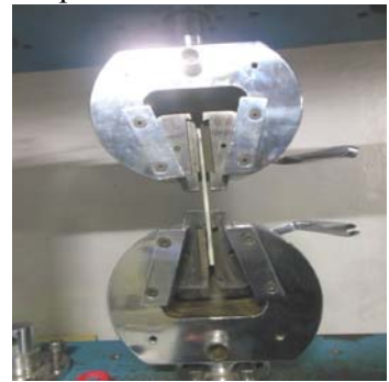
Fig. 4.Tensile test for finding material properties

In order to find tensile modulus of composite plates, Standard dog bone shaped samples were tested in an Instron 5500 machine with capacity of 200 kN. Tensile test were carried out using eight samples which were produced by cutting initial plate with water-jet machine. The constants are determined experimentally as described in ASTM standard: D 638-02 [8]. Fig. 4 shows the experimental tensile test.