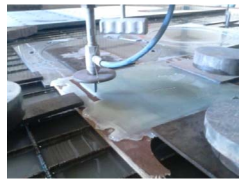
Fig. 3. Water-jet cutting

Cutting of composite plate was done with water-jet cutting technique. Nine plates of 150 mm width and 100mm height were cut from main plate. Since the objective of paper is to find effect of cut-out shape on free vibration analysis of composite plate, on each plate cut-out has to be made. Thus, four cut-out shapes were chosen, namely Rectangular, Circular, Triangular and Elliptical. Area of cut-out must be same, so that it becomes possible to find effect of shape on plate vibration. Here, area of each plate is 1500mm<sup>2</sup>. On four plates cut-out of area 900mm<sup>2</sup> is made and one plate is maintained without cut-out.