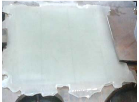
Fig. 2.Glass-Fiber Epoxy composite plate Here, we have taken 30 layers of Glass-fibre laminates. The epoxy was taken in 1:1 ratio as that of the woven glass fibre sheets. To the epoxy 10% of the hardener was added and mixed thoroughly. On clean and smooth plywood a polythene sheet was spread and the spray of the releasing agent were applied on it. Then a layer of epoxy was applied on the sheet. Over it glass fibre layer was spread and pressed thoroughly by using roller. Again a layer of epoxy was kept along with a sheet of glass fibre over it and rolled it again. This process was carried out for all the layers. Stacking sequence [0<sup>0</sup>/90<sup>0</sup>] of layers was maintained here. This whole arrangement was kept for 24 hours for hardening and after that cut it to desired size. Thickness of single layer of Glass- fibre is 0.15mm and average thickness of Glass-fibre composite plate is 4.5mm. Fig.2 shows Glass-Fiber Epoxy Composite Plate.

The glass fibre roll is cut into squares of 30 cm x 30 cm. Then according to the number of layers of composite plate to be made, that many number of fibre sheets are to be weighed.