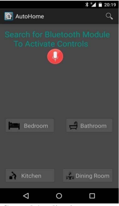
Fig4. Interface for the Voice Control Application.

In above resut pairing can be done and it may be connected to that device for switching operation. Then do switching operations of bedroom, bathroom, kitchen, dining room