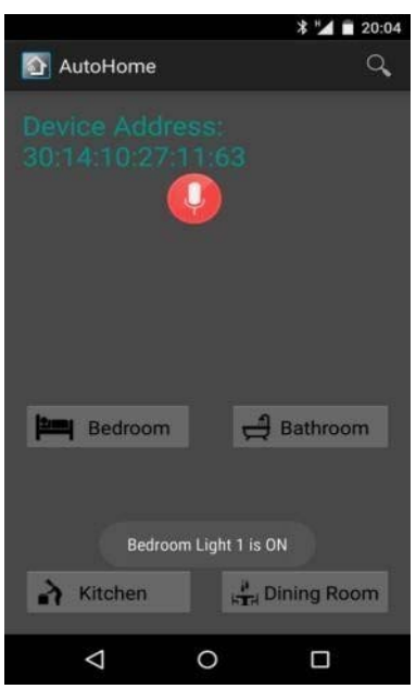
Fig5. Controlling the module with the help of appliances.

In above resut bedroom light is on and indicated on the figure by this we can operate all the appliances.