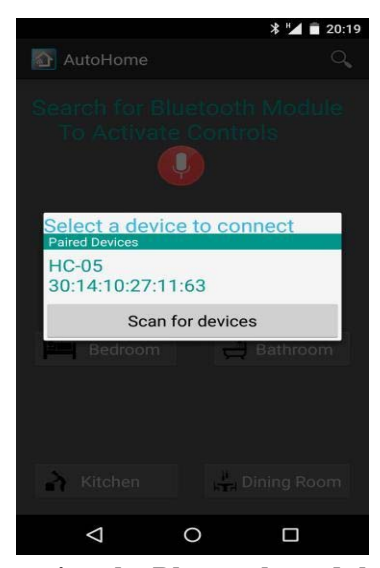
Fig3. Connecting the Bluetooth module with mobile

In above resut pairing can be done and it may be connected to that device for switching operation. Then do switching operations of bedroom, bathroom, kitchen, dining room