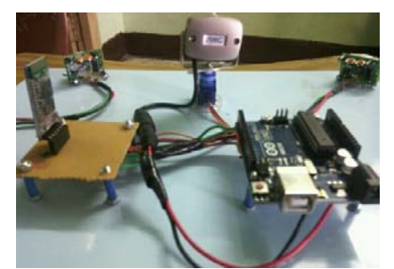
Figure 4: Transmitter of surveillance

Bluetooth is a wireless technology standard for exchanging data over short distances (using short-wavelength UHF radio waves in the ISM band in range of 2.4 to 2.485 GHz from fixed and mobile devices, and building personal area networks (PANs). Telecom vendor Ericsson in 1994, it was originally conceived as a wireless alternative to RS-232 data cables. It can connect several devices, overcoming problems of synchronization. Bluetooth is controlled by the Bluetooth Special Interest Group (SIG), which has more than 30,000 member in the areas of telecommunication, computing, networking, and The Bluetooth SIG consumer electronics. development in specification, manages the qualification program, protects and the trademarks. A manufacturer must meet Bluetooth SIG standards to market it as a device of Bluetooth. A network of apply to the technology, which are licensed to individual qualifying devices.