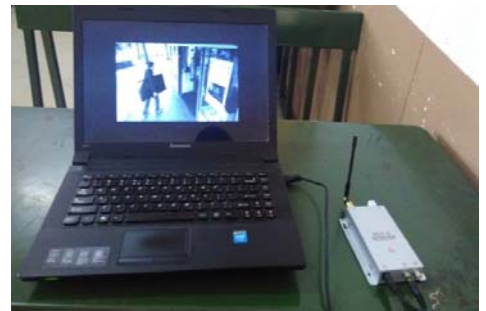
Figure 5: Camera obtained the Inducer

When the inducer enters into the unauthorized place, the camera detects the inducer with the help of AV Camera and motion sensor which is connected along with the arduino board and motor. While the inducer is detected the information is passed through the Bluetooth terminal to the surveillance area by using of mobile phones whether it is in right, left or centre. Although with the help of AV Camera receiver, the video of the inducer is obtained in pc or televisions.