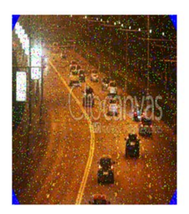
Fig .3. Test video frame.

Here the obtained spatial quality score 0.6256 lies between 0 and 1 for which the tested video is treated as a high quality video sequence.