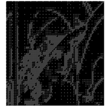
Fig. 4. Decompressed secret image.

Here the obtained spatial quality score 0.6256 lies between 0 and 1 for which the tested video is treated as a high quality video sequence.