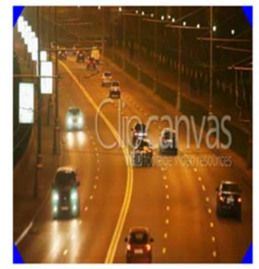
Fig. 2. Reference video frame.

The Fig.2 shows the reference video frame where the optical flow is smooth and distortions are not affected. And Fig.3 shows the test video frame affected by salt and pepper noise so that optical flow is inconsistent and hence features are affected.