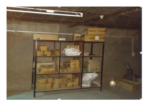
Fig. 5 Before set order

After removing scrap, we set the useful materials according to order the their respective sizes. We differentiated Baskets, bobbins and loom wheels according to the sizes, and then we set fittings into their different categories.