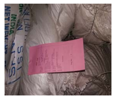
Fig.7 Red tag system

Red tag system in this we create a one format for all types of processing it contains no. of parameters which gives an idea about what will do the next of this machine or component ware the red tag is attached. We introduce these red tags to the company for their use.