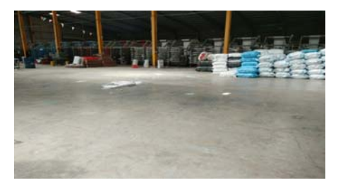
Fig. 7 Floor cleaning

Cleaning is a third method of 5S technique; we implemented this method as we were proceeding with the sorting method. As we were proceeding the sorting, we were differentiating used & not used items and then we cleaned the whole place, then after this we reached every rack & then cleaned every rack for cleaning method. For cleaning, we removed all the items from their racks and cleaned racks. While cleaning, we also fixed the air conditioner leaked pipe. In this step, we clean all places in the industry. This step has been going to the neatness and shine in the industry.