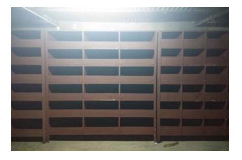
Fig.6 After set order

materials. The following fig shows the diffident arrangement of the tools and materials.