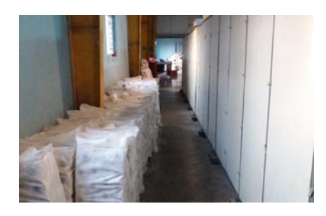
Fig. 4 After sorting and order

In sorting, distinguished the useful and scrap items. Then scrap items were kept all aside at one location which is just located beside the entrance of the storeroom. We have separated the scrap and placed it besides the entrance and named it as a scrap yard. In this scrap yard we placed all the scrap at one time and some of the scraps are placed at different location due to shortage of space.