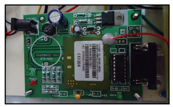
Figure 2: Experimental setup for environmental monitoring

To control and monitor the environmental variables planned in an earlier section, sensors and actuators capable of measuring and controlling the values inside the greenhouse are essential. Generally, a greenhouse control is implemented just by approximating a calculated cost to a reference or ideal cost. Figure 2 shows the basic block diagram of the proposed model. Due to cost considerations, the proposed model uses sensor network instead of wireless sensor network. The sensed data is forwarded to the gateway. The gateway then forwards the data to the remote monitoring base station. The base station is a remotely located software configured computer, where the monitored details are periodically visualized to carry out further control actions.