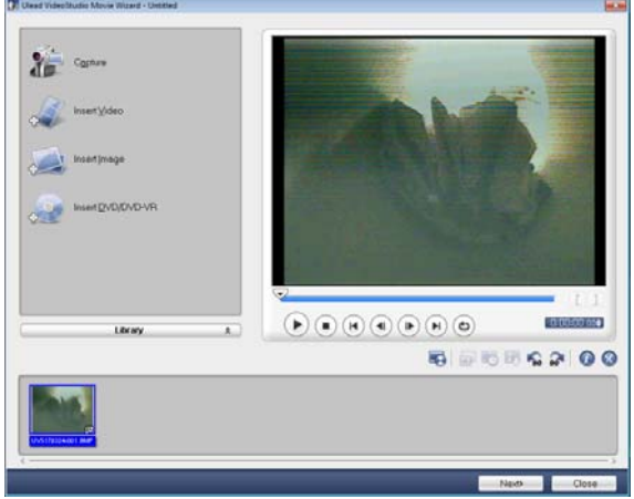
FIG. 3 Image captured by the robot

The operator views the entire process of the robot through the images sent by the camera to the PC at the user front. The images are seen on a software installed on the PC at the user front. Since a main function of the robot is yielding images from the inside of the pipe, a good view of the pipe is presented at the user front. The camera performs live streaming of the interior of the pipeline during the mission of the robot. The visuals can be recorded as a video file. FIG.3 shows an image captured by the robot inside the pipeline.