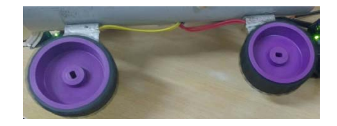
FIG. 1 Design of the robot wheels

The propeller is powered by a high voltage battery which runs a motor attached to the shaft. The motor is held in place by clamps and screws.