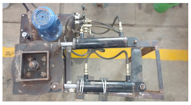
Figure 1: Multirod bending machine

made of iron plates welded together at the joints. The frame has four supporting legs with a side support to hold the hydraulic reservoir. The frame bears the loads acting during the bending operation which are produced by the cylinder motions (forward and return stroke). There are two double acting hydraulic cylinders residing on the top of the frame. One of the cylinders carries a roller which helps in applying force on the rod while bending. Another cylinder carries a lock nut by which the indexing plate is rotated to allow free rotation of the die during bending of the rod at different edges. The cylinder from which force applied for bending is fixed to the frame by welded joints and the other cylinder is free to move over the frame having one end pinned to frame. Followed by the cylinder the bending assembly comprising the base plate, index plate and the die are placed one over other in front of the cylinders. The base plate is attached to the frame through a centre shaft and welds. It carries the index plate and the die. The index plate is placed over the base plate and it is free to rotate about its centre with the help of the centre shaft. The index plate is designed with grooved edges which make it to perfectly lock the locking nut attached to the cylinder.