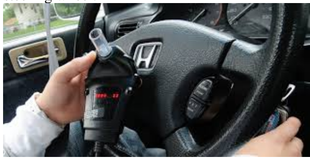
Fig.2. Position of the sensor

The position of the sensor also plays an very important role in identifying the drunk driver. The position of the AL9000P alcohol sensor should be such that it should detect only the breath alcohol level of the driver but not the breath alcohol level of passengers. Therefore the position of the sensor should be on top of the steering wheel.