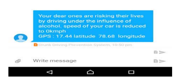
Fig 4.Snapshot of received message if alcohol level is beyond the legal limits.

If the driver is not under the influence of the alcohol ,the sensor does not recognize the alcohol content in the driver's breath and hence the vehicle move in a normal way without sending any messaging module[6].