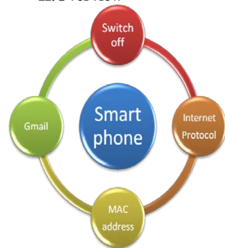
Fig.1 Overview of switch