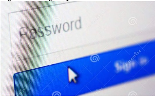
Fig.3 Enter password to switch off