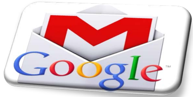
Fig.5 Because Of Gmail automatically the [sp] will not accept.