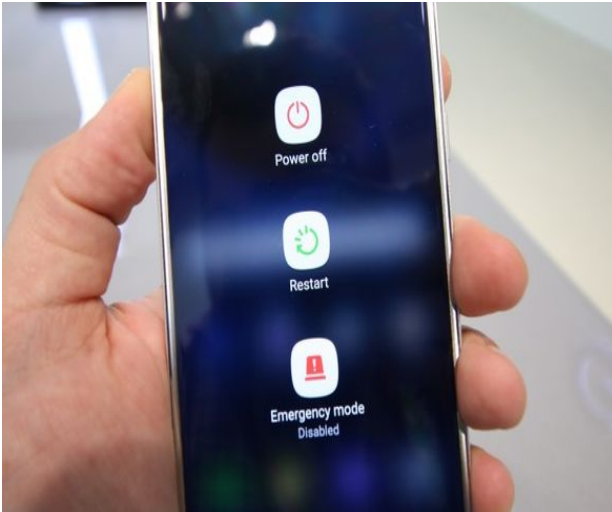
Fig.2 switching off process

off your phone.[by knowing the IP address it will send you the security pin to the particular device logged into a the g-mail it send you the pin to the correct device by MAC address].