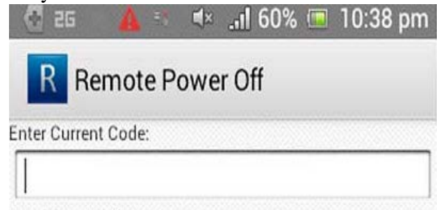
Fig.6 Entering [SP]

Press the power button immediately you can get a security pin from internet to your mail after entering the security pin you can easily switch off your device.