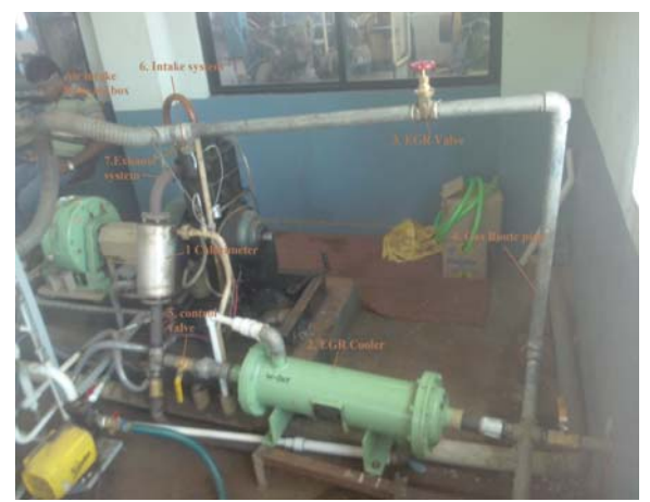
Fig 3. Engine fitted with EGR system

In cylinder pressure will measured with a watercooled piezoelectric transducer. The pressure pick up will mounted on to the cylinder head surface. A PCB Piezotronics make transducer with a sensitivity of 0.145mV/kPa will used for the purpose. A piezoelectric transducer produces a charge output, which is proportional to the incylinder pressure.