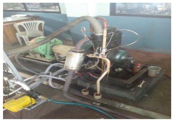
Fig1. Engine set up without EGR system

Manufacturer - Kirloskar oil engine Ltd, Pune. Single cylinder four stroke diesel engine. Cubic capacity - 661 cc Bore - 87.5 mm-110 mm Cooling system- Water Power- 7 hP @ 1500 rpm.